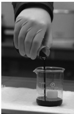
Figure 2. Fuel derived from fast pyrolysis (Jahirul et al. 2012)

The density of this fuel is around 1200 \text{ kg / m}^3 , which is considerably higher than the density of black oil. This fluid has an acidic odor that annoying the vapors of the eye. The viscosity of the fuel varies from 25 to more than 1000 cp, depending on the amount of water and the number of light components in the fuel. It should be noted that fuel specifications may change during its storage period. If the fuel contains a lot of oxygen-containing components, it is a polar nature and is not easily mixed with hydrocarbons. Normally, this fuel contains less nitrogen than petroleum products and mostly has no metal and sulfur compliments. Moreover, the nitrogen found in biomass can appear in biofuels (Van Ree and Annevelink, 2007). The products of the destruction of the components of the biomass are carboxylic acids, which cause the pH to be in the range of 2-4. This fuel is damaged by soft steel, so the fuel should be stored in acid-resistant materials such as stainless steel or polyolefin.